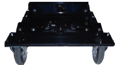
Travel Dolly Attachment