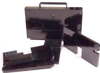
Extra Weight Package

Included Equipment: Operators Manual, Mini Weight Package (3 Front Weights), 1 Rear weight, Wheel Weights, 220 Volt 50 Amp Charger, Battery Maintenance and Fill Kit, Standard 10 Blade Package. Available Accessories: Swivel Head Attachment, Interchangeable Battery Pallet Master, Extra Weight Package, Mini Weight Package, 110 Volt Battery Charger, Channel Weights, Ceramic Tile Tooth Holder and Travel Dolly Attachment.