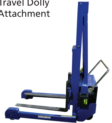
Interchangeable Battery Pallet Master