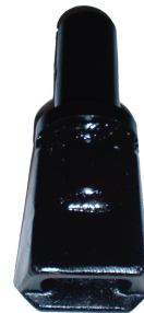
Ceramic Tile Tooth Holder