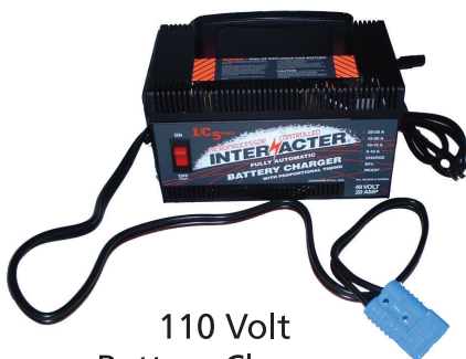
110 Volt Battery Charger